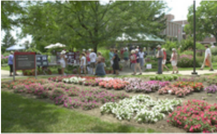
The 2nd Annual Chadwick Arboretum & Learning Gardens Open House introduced hundreds of people to one of the most varied collections of flora in the state.

Central Ohio residents didn't have to go beyond Columbus city limits to enjoy one of the best-kept secrets in horticulture. The 2nd Annual Chadwick Arboretum & Learning Gardens Open House introduced hundreds of people to the home of one of the most varied collections of flora in the state, made up of woody plants, tropical plants, wildflowers, native Ohio plants, perennials and more than 400 cultivars of newly planted annuals.