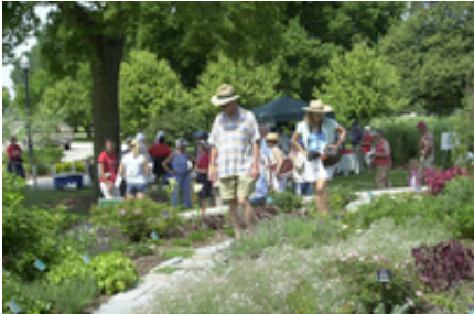
Central Ohio residents didn't have to go beyond Columbus city limits to enjoy one of the best-kept secrets in horticulture.