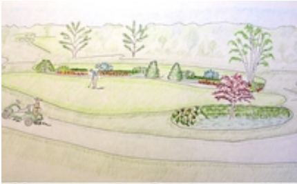
OSU Landscape Plant Selection student Kelly Mesenburg's ecologically appropriate landscape plan includes the 'right plant for the right place'.